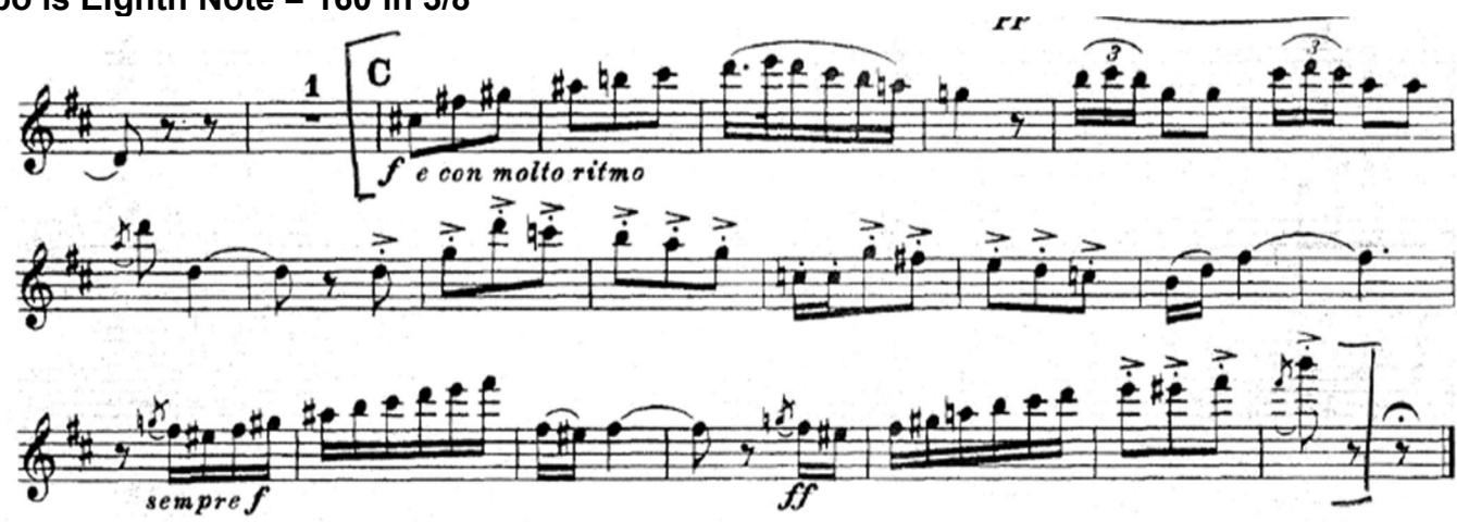
Excerpt 3: Carmen Suite No. 1 Mvt. 5 "Les Toréadors by Georges Bizet