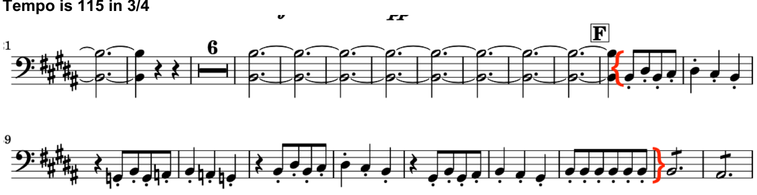
Excerpt 4: Danse Macabre by Camille Saint-Saens