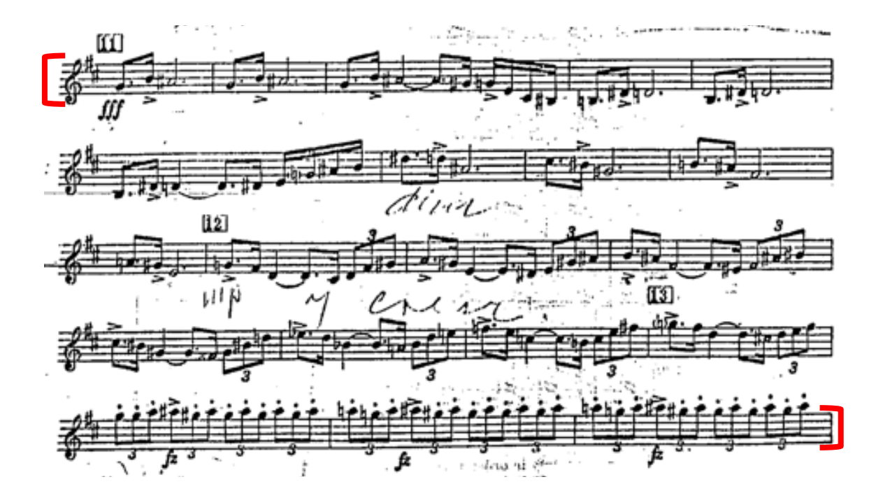
March Slav Clarinetto I in B. СЛАВЯНСКІЙ МАРШЪ МАРСНЕ SLAVE.